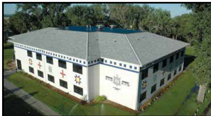
UTC's Itancan (Leadership) Hall is a modern dorm facility amid historic buildings.