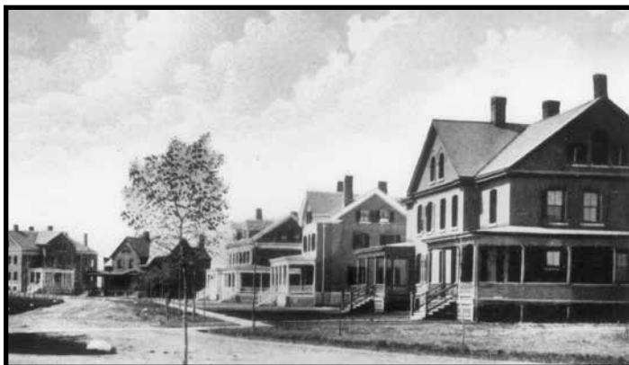
Postcard scene of Bismarck's Fort Lincoln showing officer's row. Buildings one through four, from right

Over the years the facilities also served government and civic purposes as Bismarck locals lobbied to maintain a presence that would continue the flow of federal funding into their community.