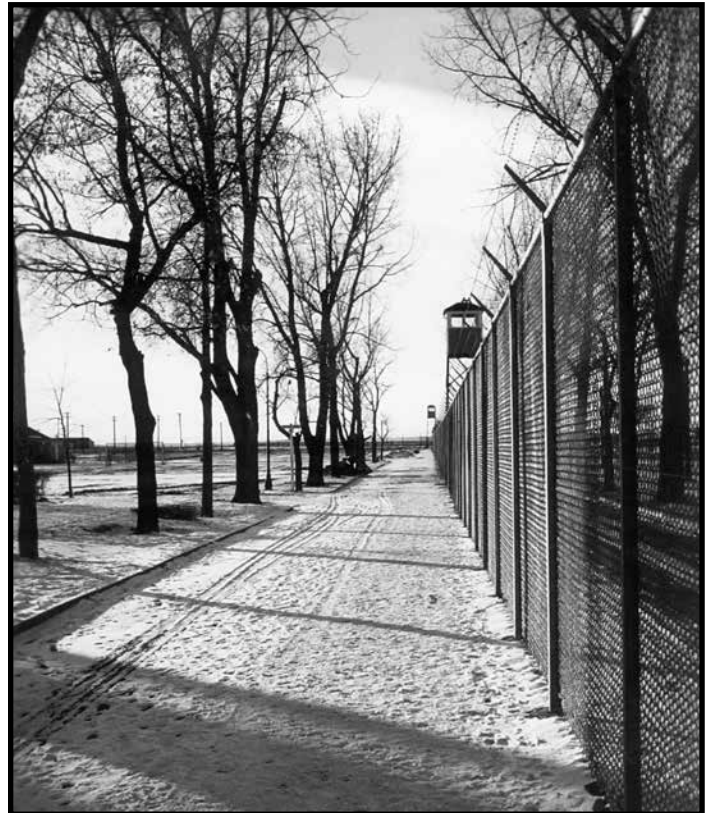
Bismarck's Fort Lincoln was fenced and guarded compound during the internment camp era, 1941-1946.

During World War Two, Fort Lincoln was tapped for another purpose. In 1941 a portion was cordoned off with 10-foot-high cyclone fences topped with barbed wire and fortified by guard towers. The post became an internment camp operated by the U.S. Justice Dept. Detained and confined were men primarily of German and Japanese ancestry – some of whom were U.S. citizens. By 1946, upwards of 4,000 internees passed through what has become known as Snow Country Prison, connecting this site with the national disgrace of unjust and unconstitutional treatment of groups and individuals targeted by race and ethnicity.