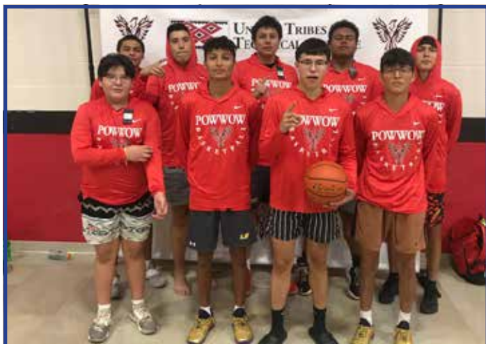
Only The Family, Spirit Lake (Boys Team) 2nd place Winner