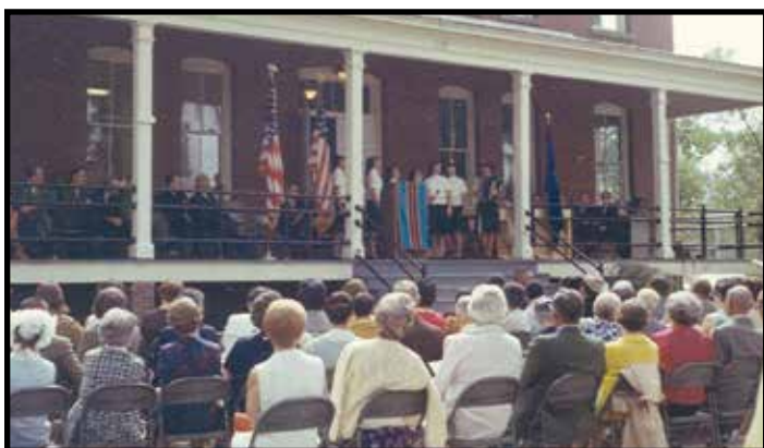
Dedication program for United Tribes Educational Training Center on September 6, 1969. Attended by dignitaries, tribal leaders and Bismarck citizens.

Because several tribes were involved, UTTC holds the distinction of being the first intertribally-controlled and operated postsecondary vocational school in the country. The governing tribes are located wholly or in part in North Dakota: Mandan/ Hidatsa/Arikara Nation, Spirit Lake Tribe, Sisseton-Wahpeton Oyaté, Standing Rock Sioux Tribe and Turtle Mountain Band of Chippewa Indians.