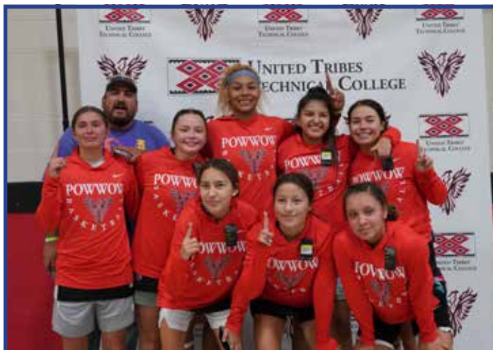
Leech Lake, Minnesota (Girls Team) 2nd place Winner