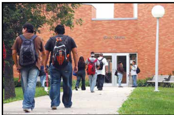
Students from all racial and ethnic backgrounds attend UTTC.

Thousands have been successful, demonstrating that educating students at United Tribes Technical College is the highest and best use of a one-time military fort in the tribal homeland.